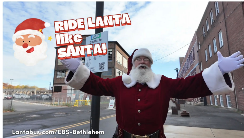
Ride LANTA like Santa in Bethlehem this Holiday Season